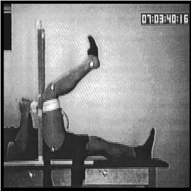
Figure 1. Setup for measuring hamstring muscle length using PEAK Motus motion analysis system.

Reflecting markers 2.54 cm (1 in) in diameter were placed on the subjects' right lower extremity over the greater trochanter, the middle of the lateral joint line of the knee, and the lateral malleolus. Proper alignment of the right thigh parallel to the vertical post of the alignment apparatus and perpendicular to the horizontal surface of the plinth was verified using the video monitor (Fig. 1).